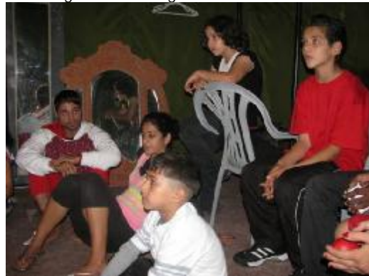
The crowd in Tulkarem