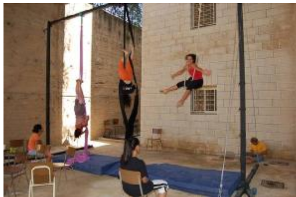
Training on the brand new aerial structure

The whole program was financed by the Royal Danish Representative Office and the DCCD, with the support of the MIP program of the Belgian Technical Cooperation, that offered us to buy a real sound system and aerial structure to tour around with and to train in the different locations.