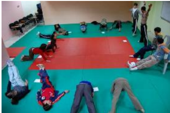
Warming up in Hebron

In Hebron, in cooperation with Sharek Hebron, we continue to give trainings every Saturday in the Child Happiness Centre and our group is the same one of last year but has now moved to a more advanced level. We work with one group of 18 boys and girls between 12 and 16 years old.