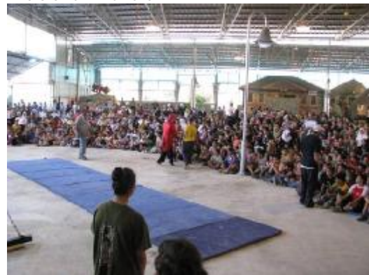
and in Jenin