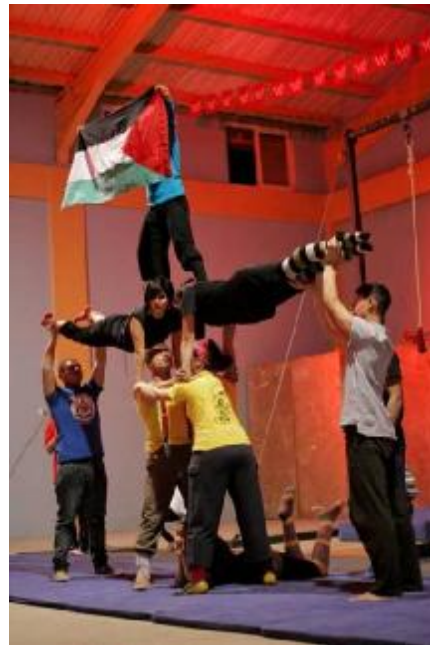
With the support of Al Watanya Mobile Company