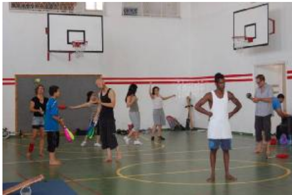
Training at the Episcopal Training Center

The Palestinian Circus School in cooperation with the Danish Goglerskolen (Arhus) developed a full training program for two weeks for the trainers and 10 of the advanced students of the Palestinian Circus School. During two intensive weeks in July - August, the Danish trainers (who came with a team of 8 teachers and students from their school) were introduced in the reality of Palestine and in the power of its children and youth in the circus. The result of the two weeks of training was a beautiful and dynamic show with a lot of circus, but also some hip hop.