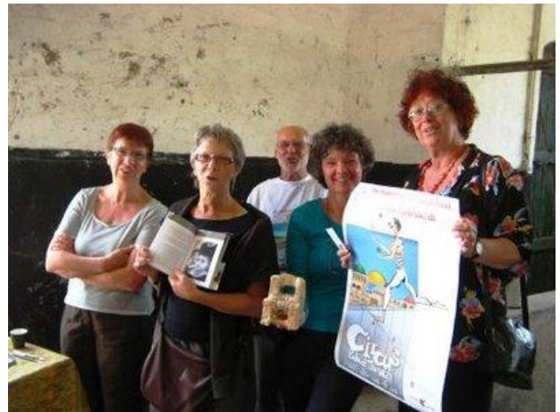
The chair project initiators in Belgium and Holland