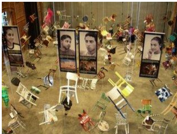
The expo sale in Mons

All the support of the chair project will be put aside to support a future permanent infrastructure for the circus school. More to follow in 2009.