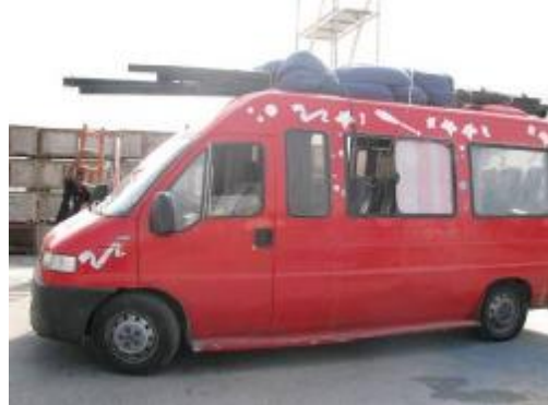
Backstage .. like the big ones..

The Circus on the Road - to the Golan here..